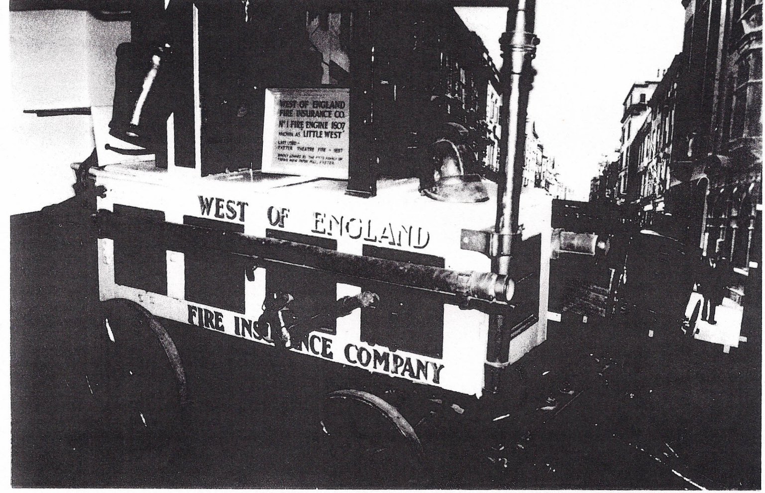
The Little West arrived first